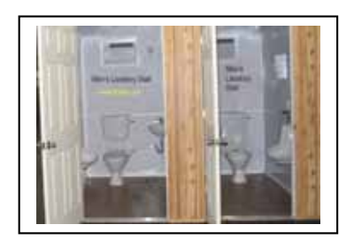
Dual Comfort Station