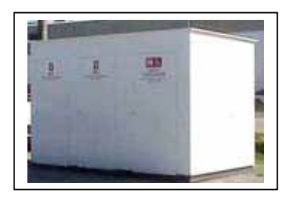
2 Units Plus ADA (Handicap)