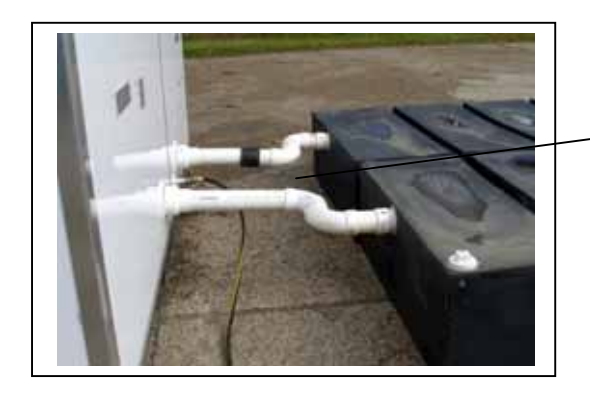
Holding Tank and Garden Hose Connection