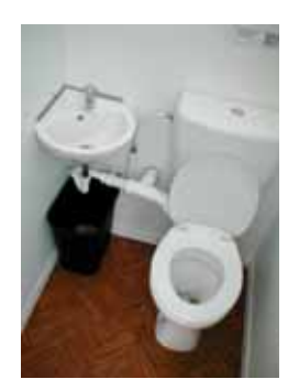
Fig. 3 - Model 4848