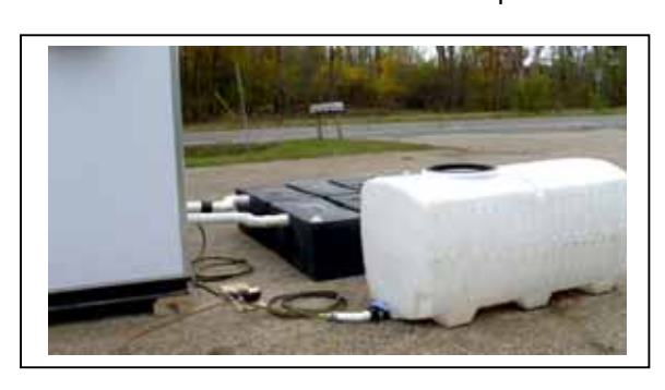
Holding Tank With Pressurized Water Tank