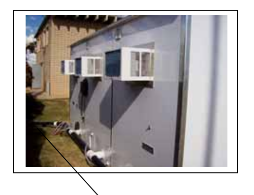
Sewer or Septic Tank Hook-up