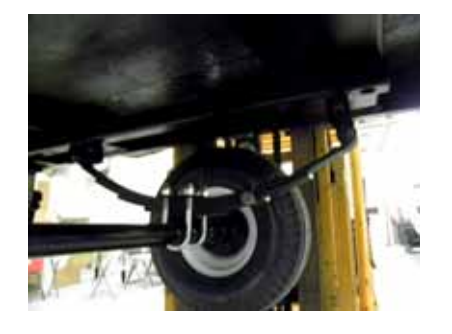
Fig. 7 Trailer Spring and Axle Assembly (removable)