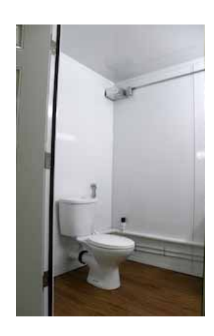
Fig. 2 Exhaust Fan/ Studor Vent