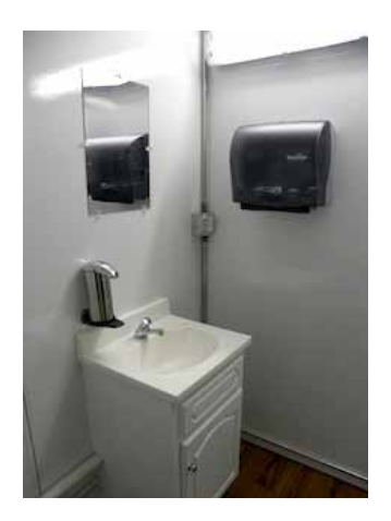
Fig. 3 Vanity - Automatic Soap/ Paper Towel - Safety Light Mirror – Smoke Detector Fire Extinguisher GFI Electrical Receptacle