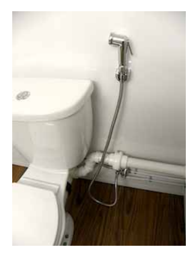
Fig. 1 Bidet/Water Saver Flush