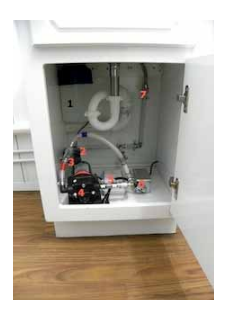
Model 7575RTF-2WTMSS Vanity