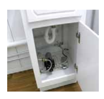
Fig. 4 Water Pressure Pump in Vanity

Fig. 3 Vanity - Automatic Soap/ Paper Towel - Safety Light Mirror – Smoke Detector Fire Extinguisher GFI Electrical Receptacle