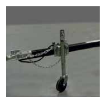
Fig. 6 Hitch Receiver 2' Ball Shown (removable) Pintle Hitch Included