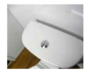
Fig. 5 Water Saver Cistern