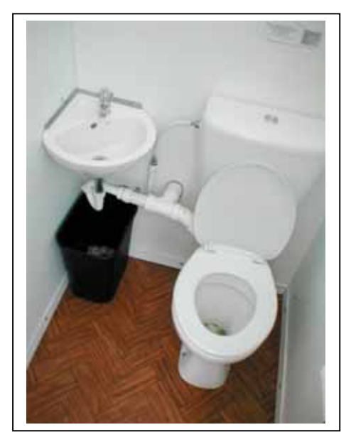
Sani Jon® + Ground Level Fresh Water Flush System Patent #6,721,967