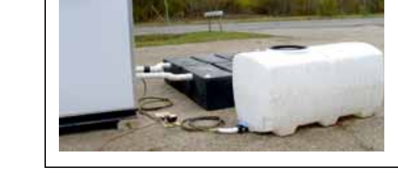
Water Tank and Water Pressure System + Waste Tank Hook-Up