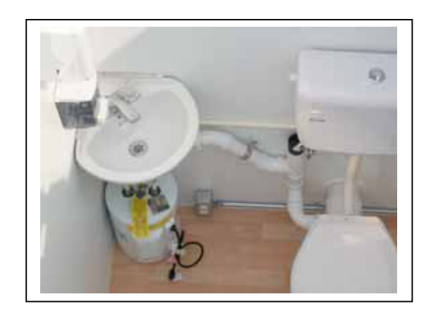
Fig. 6 Open Door Front View