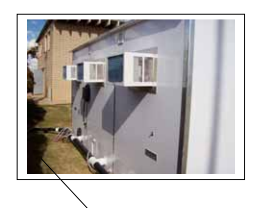
Sewer or Septic System Hook-Up