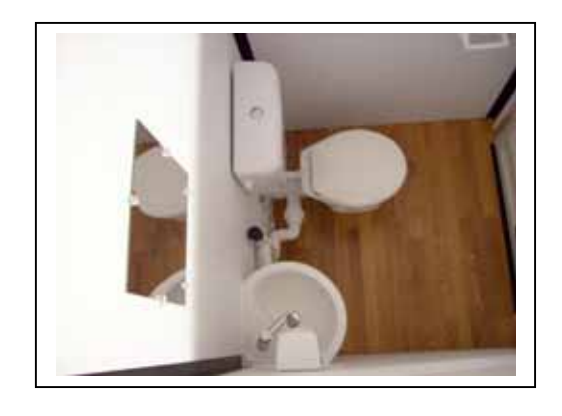
Fig. 4 Top View