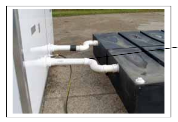
Holding Tank and Garden Hose Connection