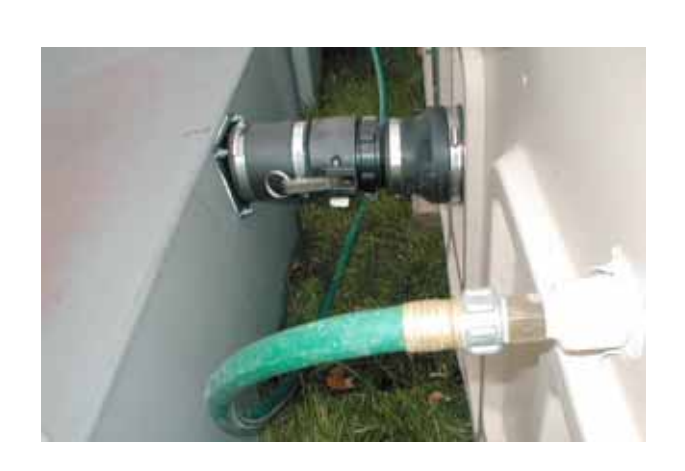
Water and Sewer Connection