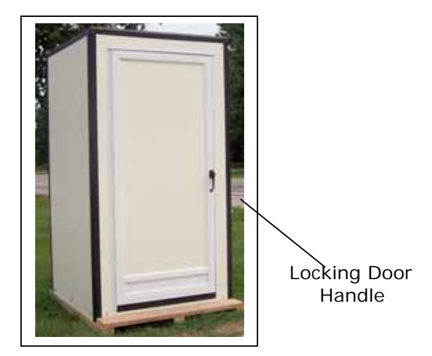
Fig. 7 Front View Closed Door