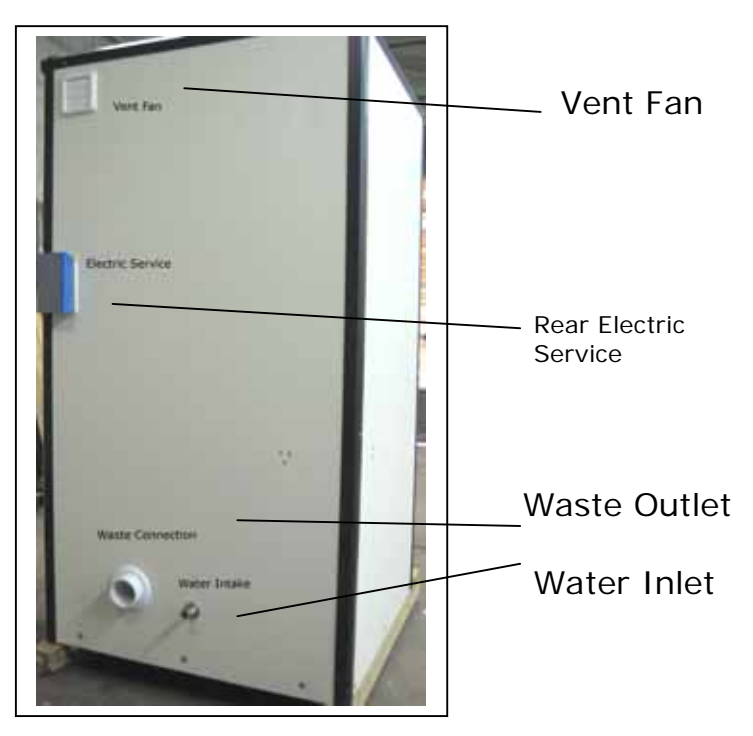
Fig. 8 Rear View Plumbing Connections