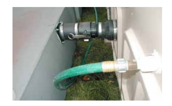
Garden House Hook-Up Holding Tank Hook-Up

The water and waste hook-ups can reduce or eliminate the cost of servicing the Comfort Stations.