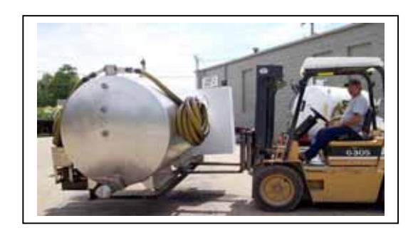
900 Gallon Waste Tank 300 Gallon Chemical Tank

Pump From Both Sides - Power Wash From Both Sides - Draw Chemical From Both Sides