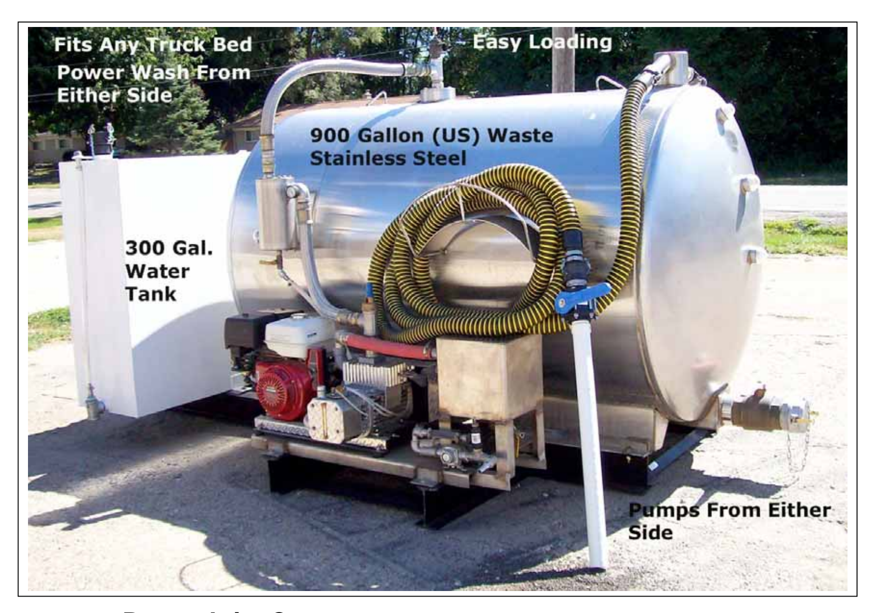
Porta John®: One-Piece Pump System Platform for Easy Mounting