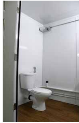
Fig. 2 Exhaust Fan/ Studor Vent