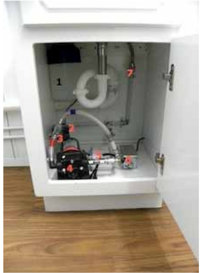
Model 7575RTF-2WTMSS Vanity