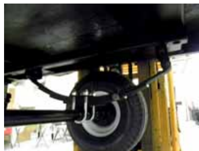
Fig. 7 Trailer Spring and Axle Assembly (removable)