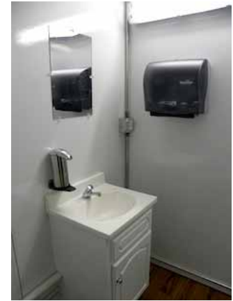
Fig. 3 Vanity - Automatic Soap/ Paper Towel - Safety Light Mirror - Smoke Detector Fire Extinguisher GFI Electrical Receptacle