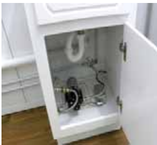
Fig. 4 Water Pressure Pump in Vanity