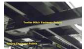
Fig. 8 Trailer Hitch Assembly (removable)