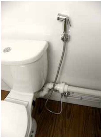
Fig. 1 Bidet/Water Saver Flush