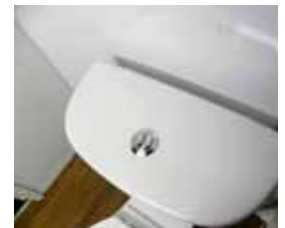
Fig. 5 Water Saver Cistern