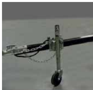
Fig. 6 Hitch Receiver 2' Ball Shown (removable) Pintle Hitch Included