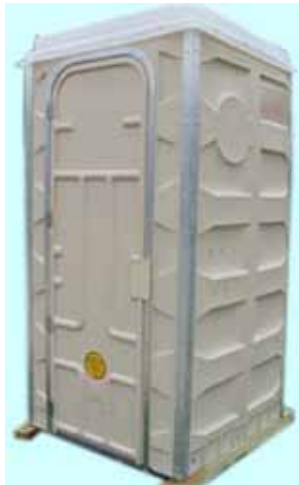
Model GJ 350