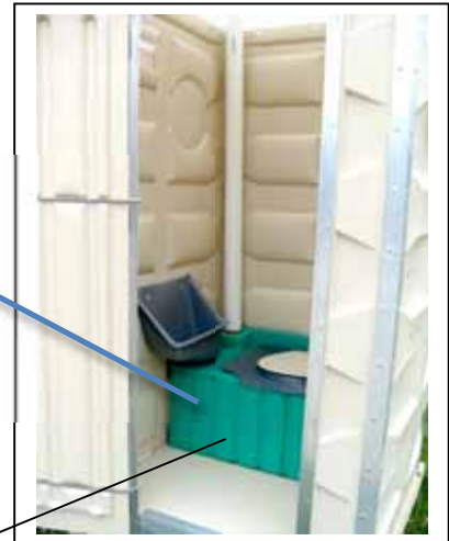
Front View of Flip Top Tank

Our reference list (see below) is testimony to the success of the portable toilets we manufacture and service. The Green John® offers long-term low maintenance sanitation.