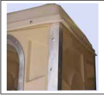
2" Aluminum Corners For Durability