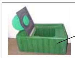
65 Gallon Holding Tank