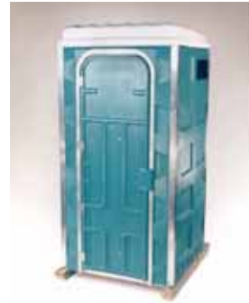
One Piece Aluminum Door Frame