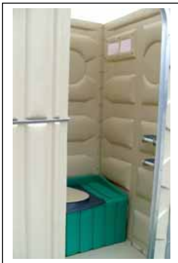
Made From Recycled Materials