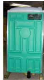
SJHD 450DV Rear View of Dump Valve

All trailer mounted HD450 Units can be fitted with a dump valve.