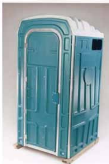
Model SJHD 450

The Sani Jon® has double covered corners and is manufactured to be both versatile and sturdy to allow for years of use. It is fitted with dump valves, showers, comfort stations and hand wash sinks. The Sani Jon® is shipped 80% assembled and 40 can be shipped in a 20' container.