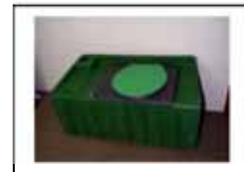
Flip Top Holding Tank

Assembles and disassembles in less than 3 minutes