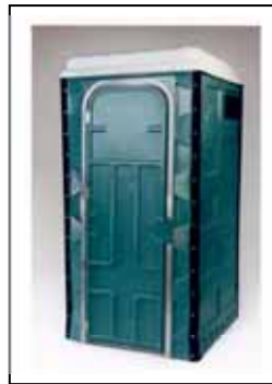
Model FPT 300