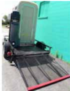
SJHD 450TMSS Trailer Mounted Side Sink