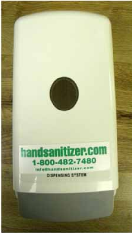
www.handsanitizers.com www.toilets.com Hand Sanitizer Dispenser Included in the Consumables Package