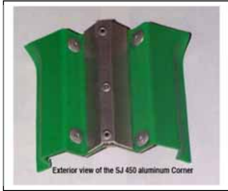
Exterior Aluminum Corner

The unique characteristics OF Model SJHD 450 portable toilet are: Dimensions 44" (112cm) x 44" (112cm) x 89" (239cm) Holding Tank Capacity 68 Gallon (268 liters)