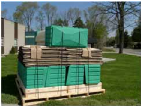
10 Complete Model FPT 300

Ships Completely Assembled in the Folded Position. Flip Top Holding Tank Allows for Complete Cleaning and Inspection For Trash