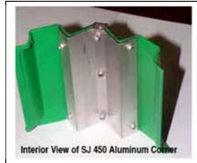
Interior Aluminum Corner