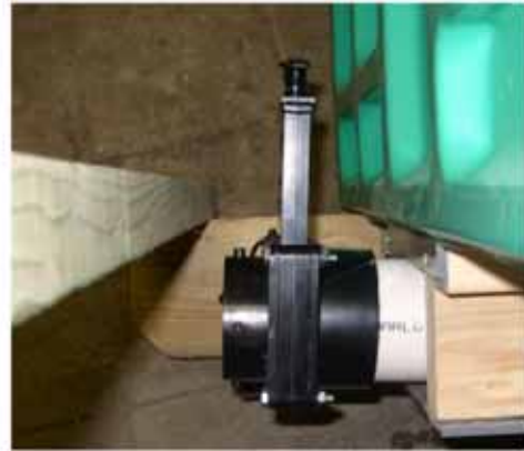
Rear View Of Dump Valve With Cap