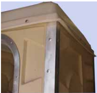
Aluminum Covered Edges

Economical, Attractive Designed for Low Maintenance Light-Enhancing Roof 41" x 41" x 80" 186 lbs.