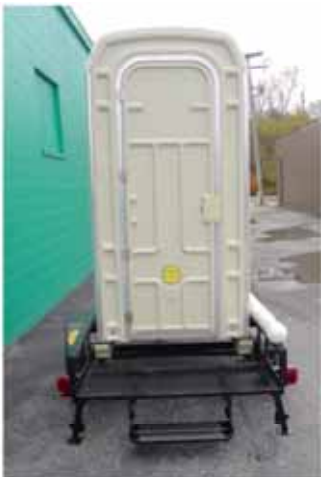
Front View of Trailer Mounted SJHD 450 With Dump Valve