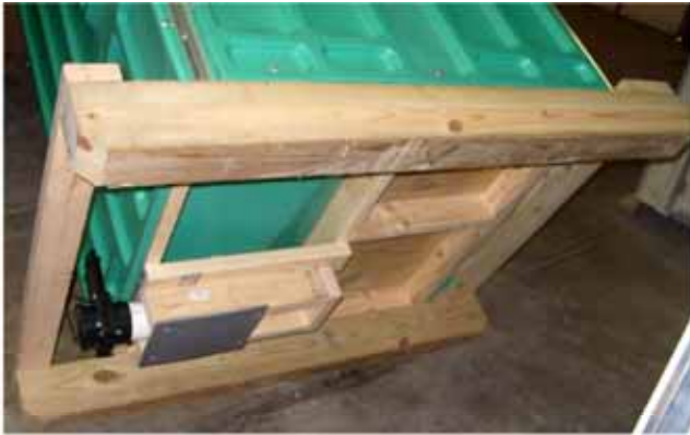
SJDV 450 – Under-Section Dump Assembly