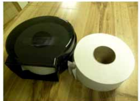
Equivalent to Five Standard Rolls of Toilet Paper