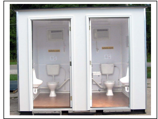
Standard Dual Stall Men's Unit