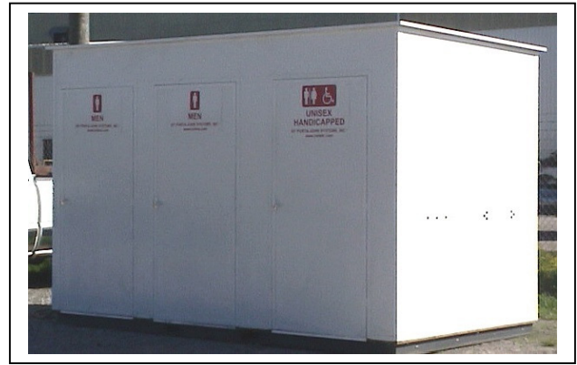
Three Stall Building With Optional ADA Stall Model TH 7513 ADAMF