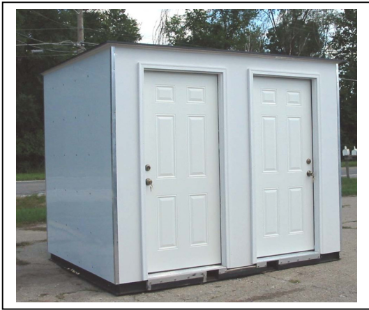
Model #Dual 810m