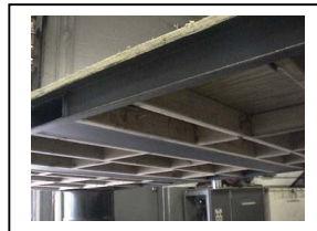
Steel Frame Under-Section