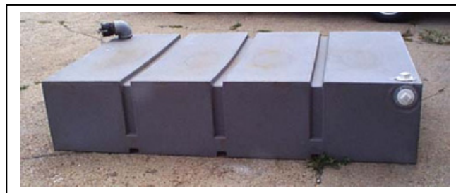
Model HT 304